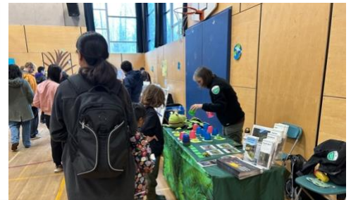
Metro Parks rangers showing students forest treasures at the Uhill Earth Day BBQ

On April 20, UHill Elementary welcomed students, parents, and community partners to its annual Earth Day BBQ celebration. While the rain moved this year's BBQ into the gym, it didn't dampen the students' excitement of learning how they can do their part to help the environment.