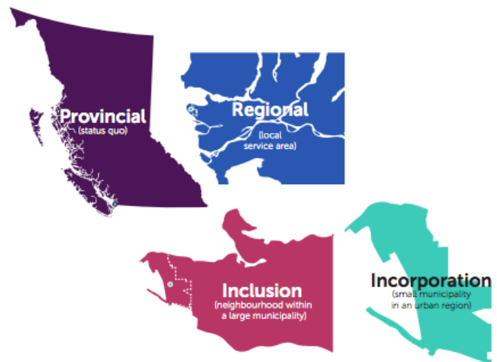
The four governance options explored in the UEL Governance Study.