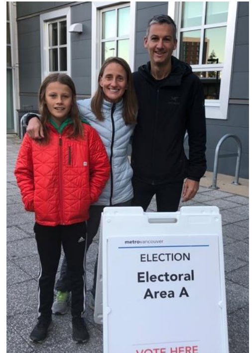
Nervously heading UHill secondary to cast my vote on October 15 th (with my husband and son)