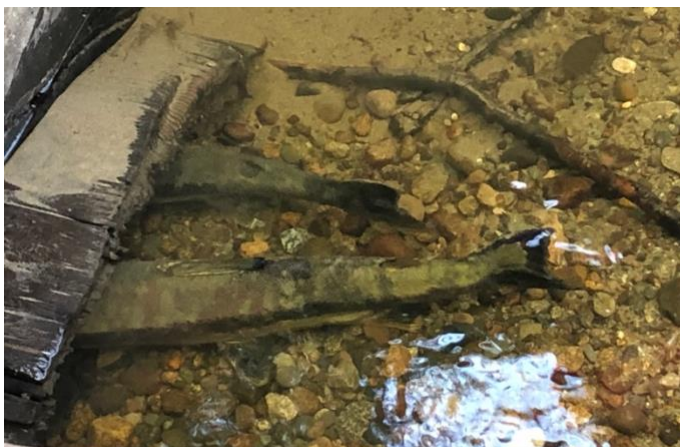
Two adult Chum salmon returning to Spanish Banks Creek

While this story refers to sometime on the boarder of Electoral Area A, I thought that it was too exciting not to share! Chum salmon are currently returning to Spanish Bank Creek to spawn! These incredible animals are born in the creek, head out to the North Pacific for 3-6 years, and then return to their same creek to spawn and then die. The carcass of the dead salmon are rich in nutrients and energy that feed animals such as eagles, and also enrich our forests. The carcasses also improve newly hatched salmon growth and survival by contributing nitrogen and phosphorous compounds to streams.